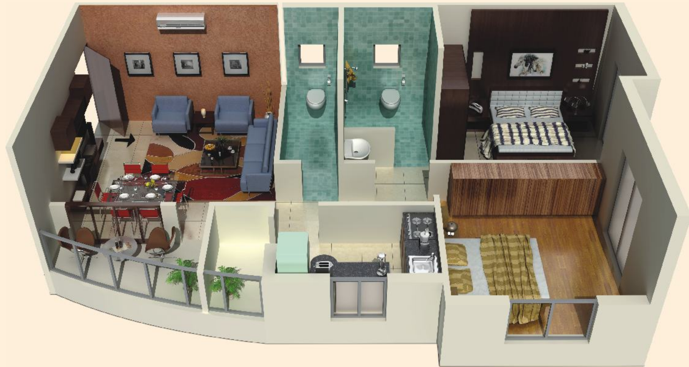
3D Floor Plan - 2BHK